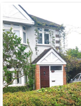
▲ Her house