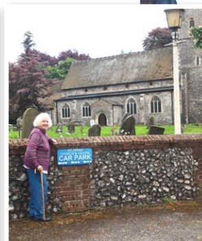
▲ Her church