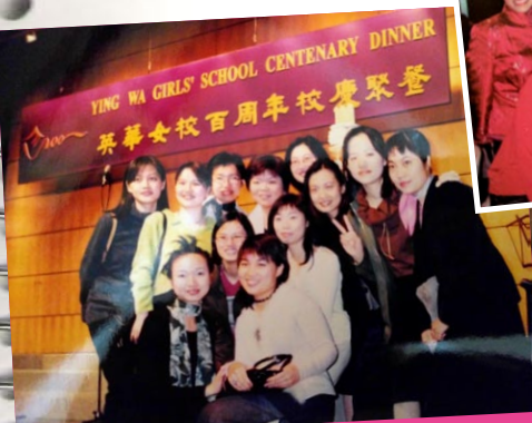
YWGS Centenary Dinner (2000)