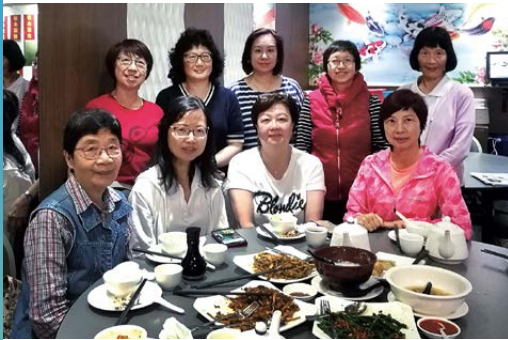
▲ Lunch Get-together