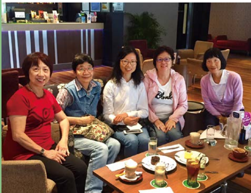
▲ Afternoon Tea