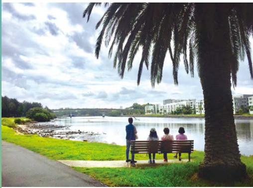
▲ By the Riverside