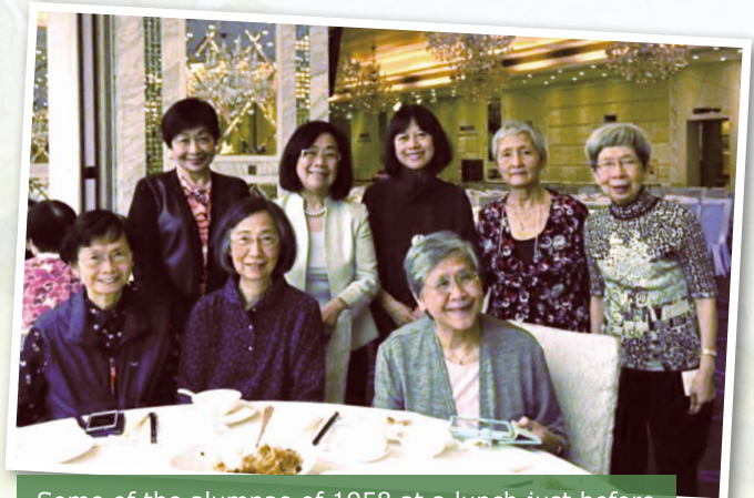
Some of the alumnae of 1958 at a lunch just before the 115th Anniversary Dinner