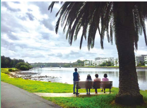
▲ By the Riverside