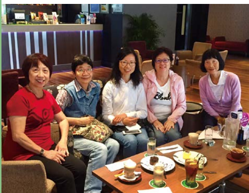
▲ Afternoon Tea