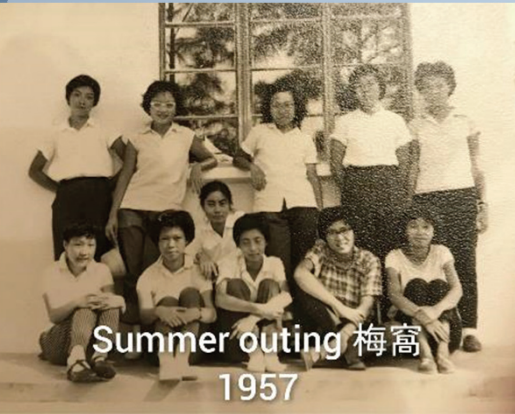
Summer outing 梅窩 1957