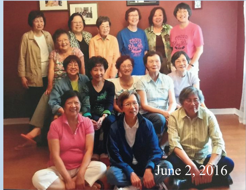
June 2, 2016