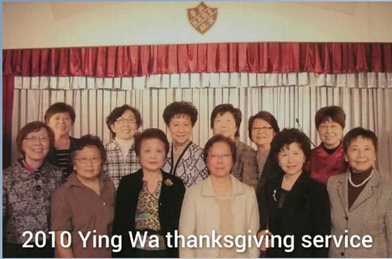
2010 Ying Wa thanksgiving service