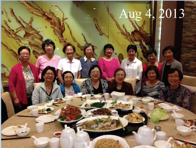
Aug 4, 2013