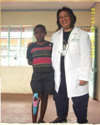
my Kenya young patient