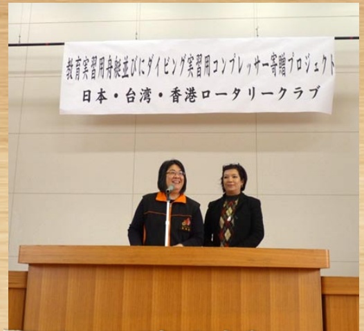
Help to rebuild the fishery school after 311 in Japan