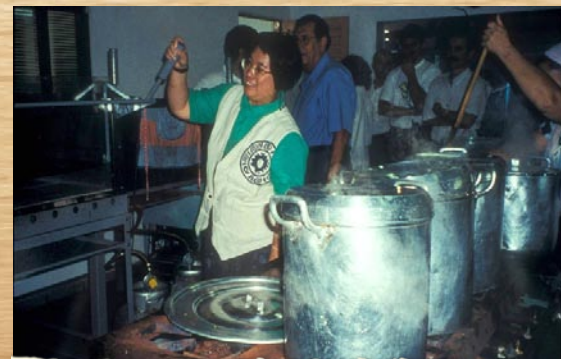
Working in central kitchen for Women welfare center in the squatter area in Brazil