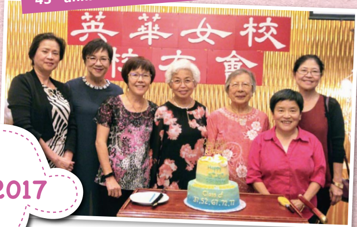
Class of '72 celebrating 45 th anniversary