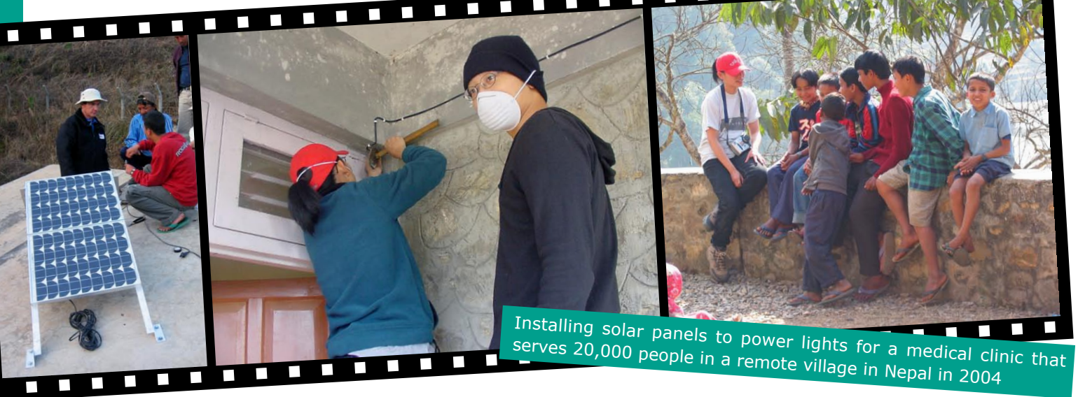
Installing solar panels to power lights for a medical clinic that serves 20,000 people in a remote village in Nepal in 2004