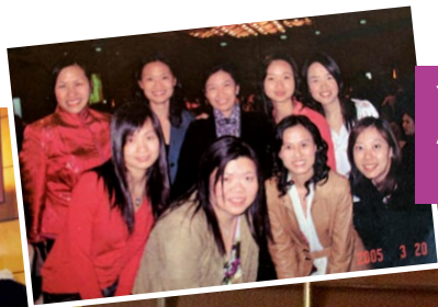
YWGS 105th Anniversary Dinner (2005)