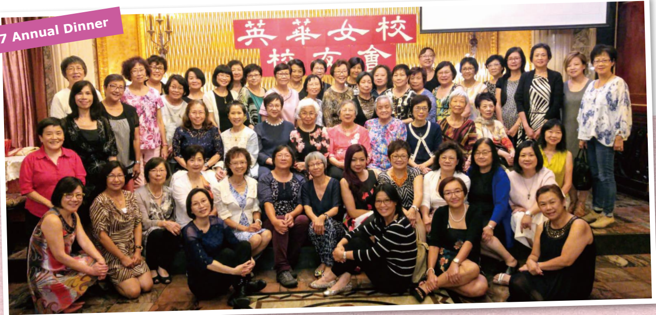
2017 Annual Dinner