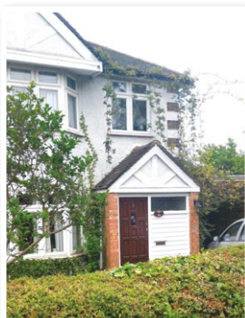
▲ Her house