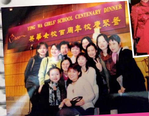
YWGS Centenary Dinner (2000)