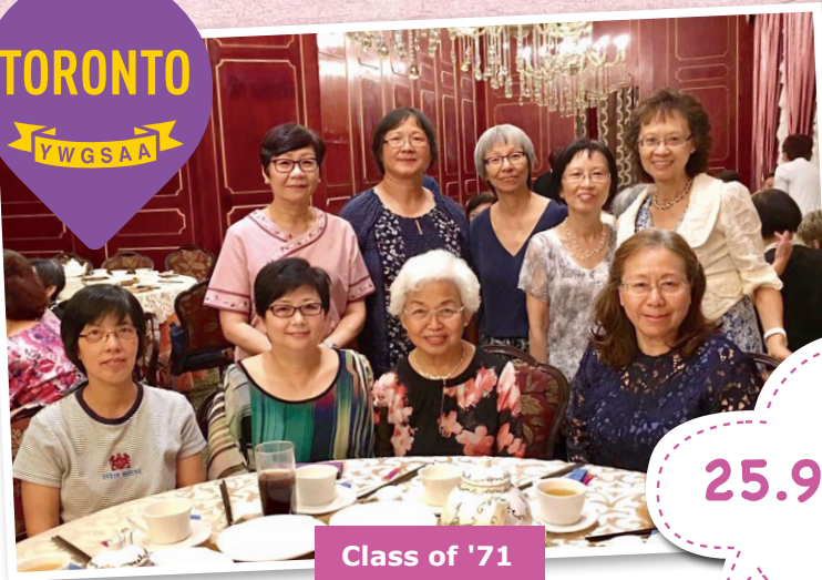
Class of '71