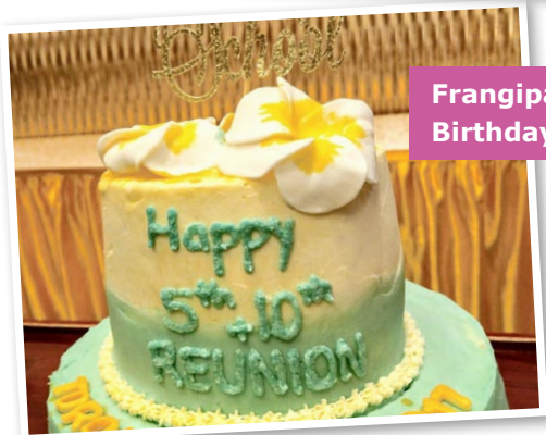
Frangipani Birthday Cake