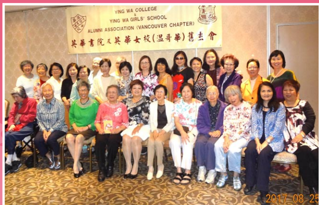
▲ Group photo