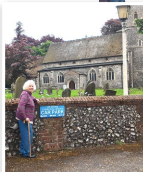
▲ Her church