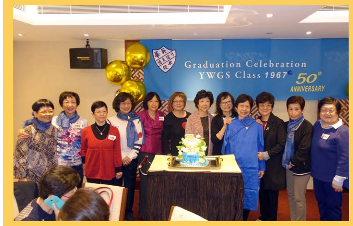
Posing with old school uniform