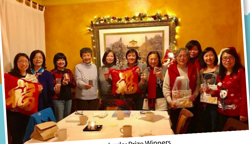
Lucky Prize Winners