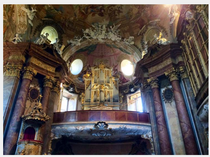
Organ in the Ludwigsburg Castle, Germany