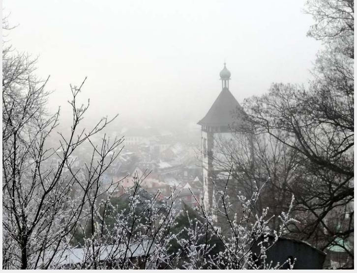
Freiburg, Germany in Winter 2016

I graduated from Ying Wa in 2012, as one of the first batch of Diploma of Secondary Education students. I then started studying European Studies at the Hong Kong Baptist University, and left for a degree in music in Germany in April 2013. I chose to pursue something I am passionate about. I am often considered one of the luckier ones who left Hong Kong early enough and got rid of all sorts of stress other Hongkongers face daily.