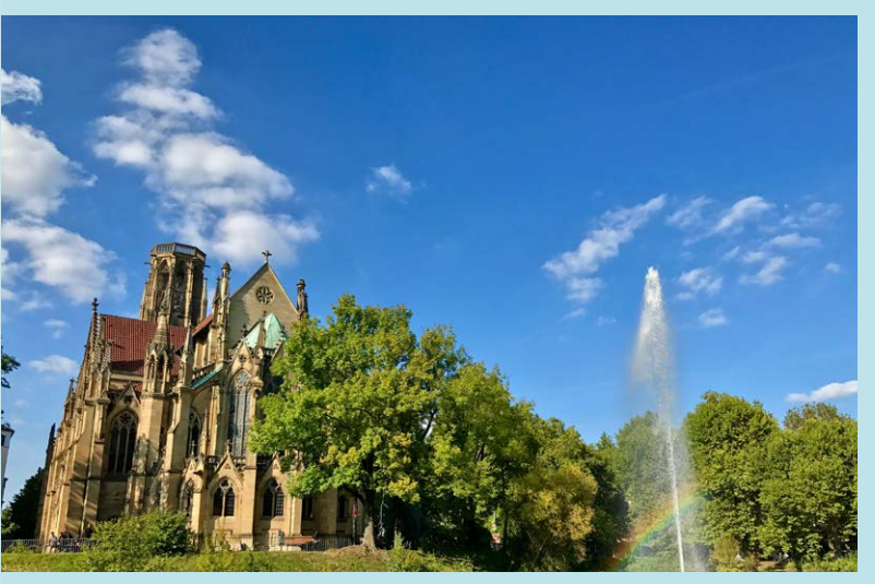
Stuttgart, Germany in late summer/early autumn 2017