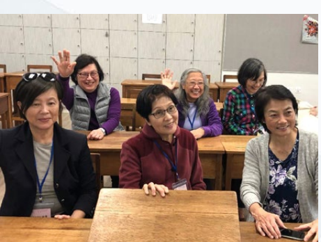
Attentive students in the 1960s