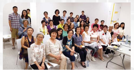
▲ Group photo